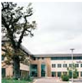
Application Support Centre

Hosting in 'Zones' (Co-location, Managed & Mistral Systems all separate)