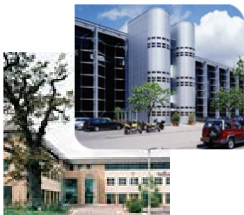
Data & Application Support Centre

Chapter26 is a Specialist Solutions Provider which design, implement & integrate collaborative business environments through the secure management of content. Chapter26 is BEA Value Added Reseller, EMC Documentum Select Service Team, Microsoft, VMWare, Kofax & Sealed Media Partner.